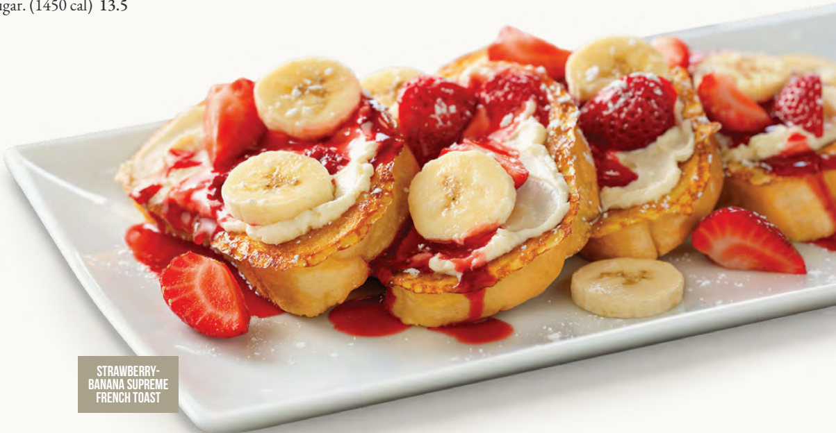
STRAWBERRY- BANANA SUPREME FRENCH TOAST

4 slices of vanilla-battered french toast topped w/ sweet supreme cream, fresh strawberries and sliced bananas. (850 cal) 13.5