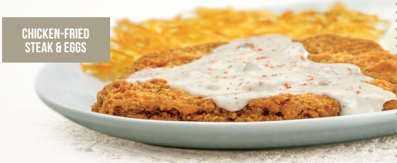
CHICKEN-FRIED STEAK & EGGS

corned beef hash & eggs* served w/ scrambled eggs, hash browns and your choice of toast, english muffin or three made-from-scratch buttermilk pancakes. (680-1040 cal) 12.75