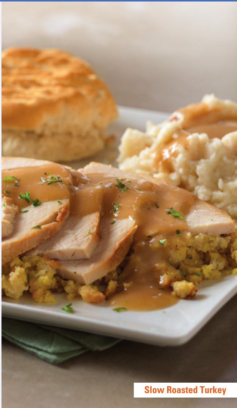
Slow Roasted Turkey

Roasted chicken breast with carrots, celery, peas, potatoes and onions in a creamy sauce, topped with a flaky pie crust. Served with a fresh side salad. (1300-1460 cal) 15.79