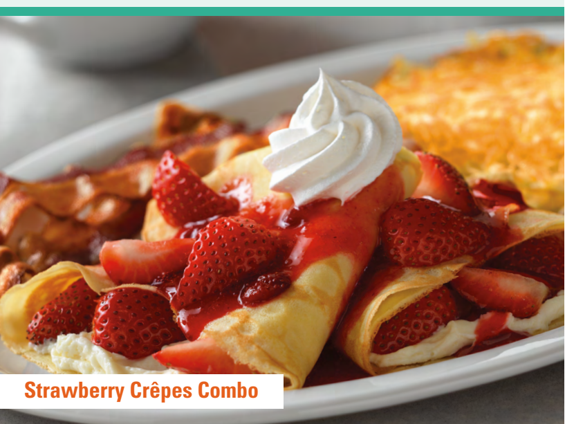
Strawberry Crêpes Combo