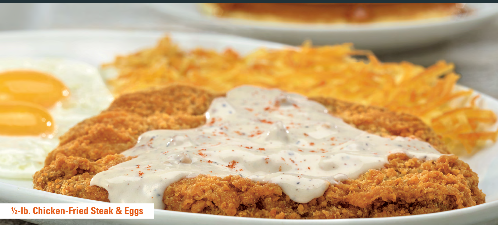
1/2-lb. Chicken-Fried Steak & Eggs

Toasted wheat bread topped with smashed avocado, tomatoes and everything bagel seasoning. Served with 2 eggs and fresh fruit. (460 cal) 13.49