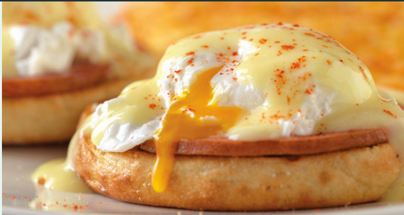
Classic Eggs Benedict

Two poached eggs over grilled tomatoes, onions, sliced mushrooms and fresh spinach atop a toasted English muffin with bacon and Swiss cheese. Topped with Tomato Basil Hollandaise and fresh avocado slices. Served with golden hash browns or grits. (720 cal) 16.89