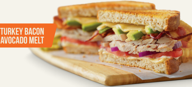
TURKEY BACON AVOCADO MELT

POT ROAST SANDWICH Served open-faced with mashed potatoes and brown gravy as suggested side choice. (890 cal) $14.99