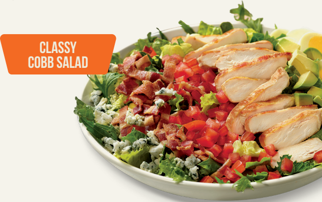
CLASSY COBB SALAD

TACO SALAD Tortilla bowl with lettuce, choice of seasoned ground beef, chicken or carnitas, beefy red chili or pork green chili, cheddar cheese, tomatoes, avocado and sour cream. Served with salsa. (790-900 cal) $13.99