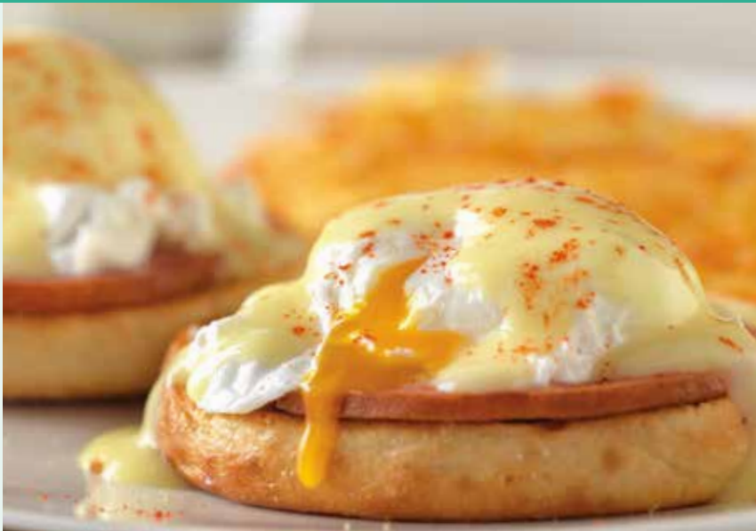
Classic Eggs Benedict

Two poached eggs over grilled tomatoes, onions, sliced mushrooms and fresh spinach atop a toasted English muffin with bacon and Swiss cheese. Topped with Tomato Basil Hollandaise and fresh avocado slices. Served with golden hash browns or grits. (720 cal) 14.29