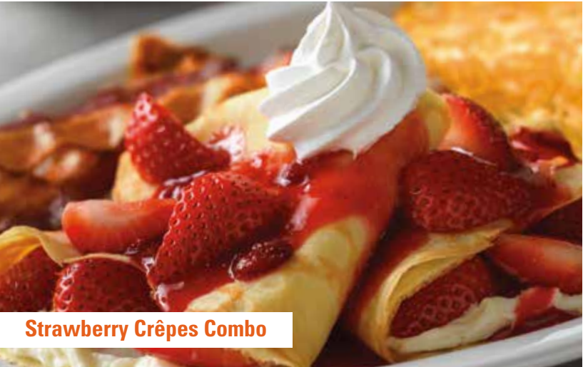
Strawberry Crêpes Combo

Two made-from-scratch crepes filled with scrambled eggs, diced hickory-smoked bacon and onions, then covered in fresh Hollandaise sauce, melted Swiss cheese and diced tomatoes. (1135 cal) 12.99