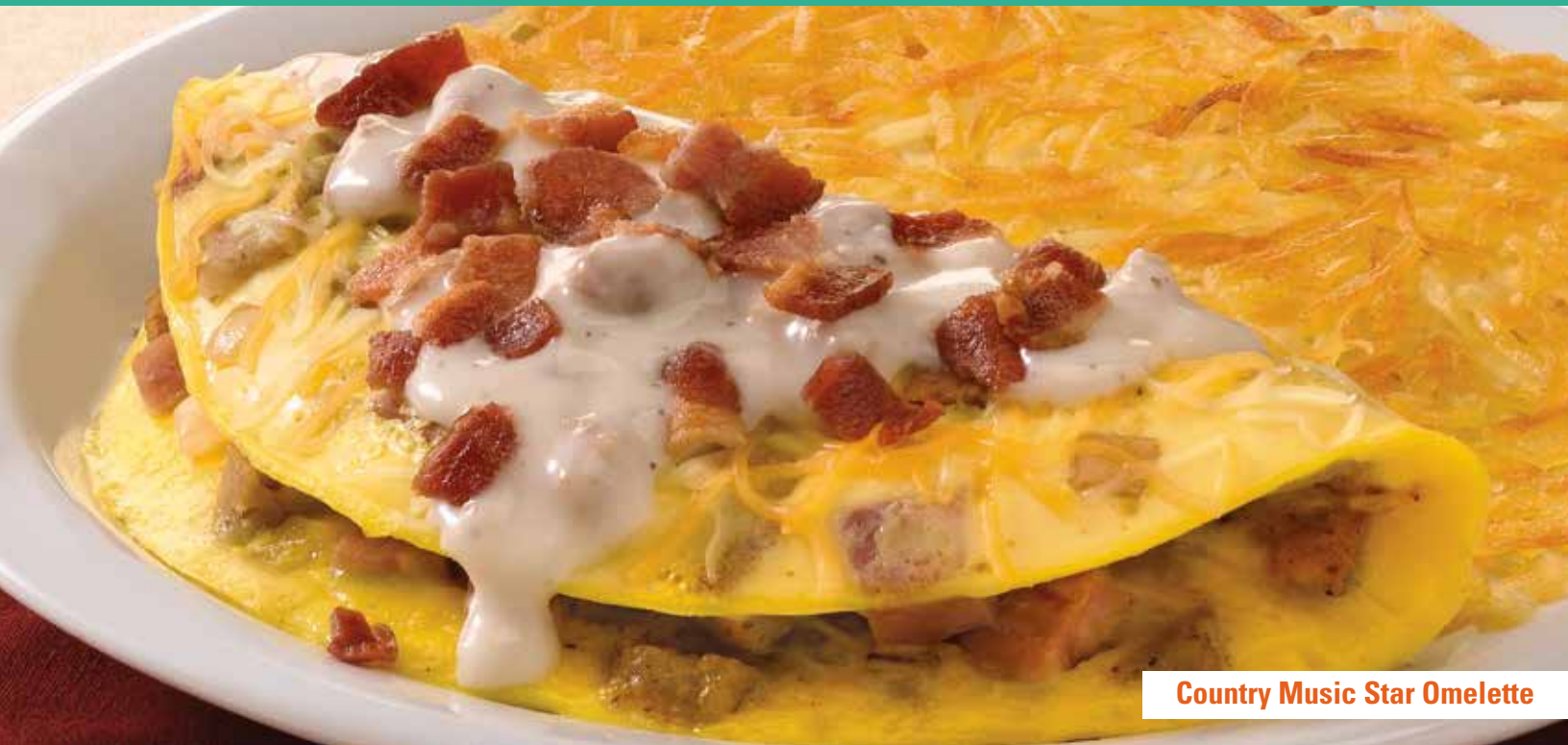
Country Music Star Omelette

2,000 calories a day is used for general nutrition advice, but calorie needs vary.