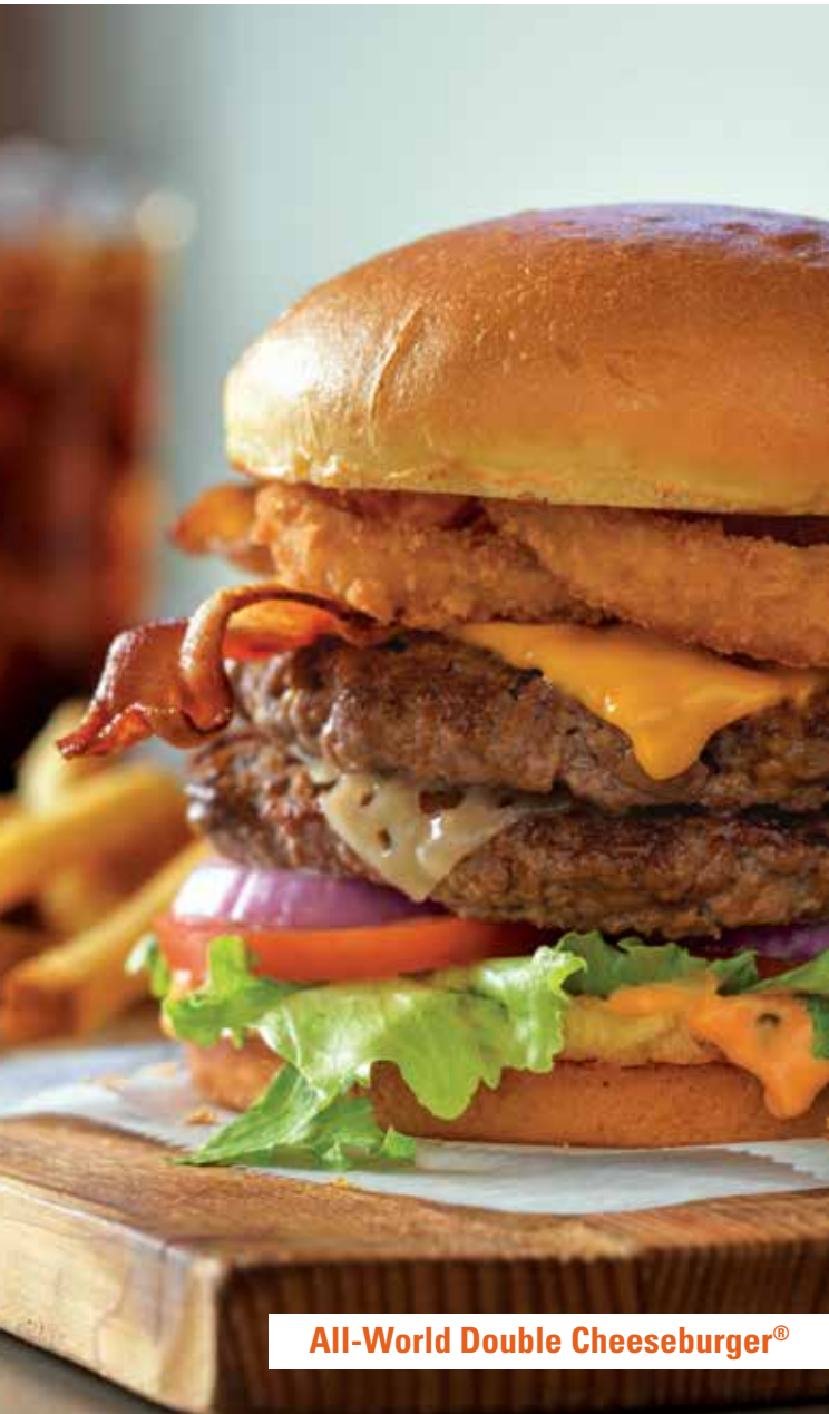
All-World Double Cheeseburger®

Tender ground beef patties seasoned and grilled. Served with lettuce, tomato, red onions, pickles and a grilled brioche bun. Choose French fries (370 cal) or fresh coleslaw (140 cal). Substitute a cup of fresh fruit (30 cal), fresh side salad (35 cal), cup of soup (45-310 cal) or side of onion rings (220 cal) for 99 cents. Substitute a grilled all-white meat chicken breast with any of our burgers (subtracts 170 cal).