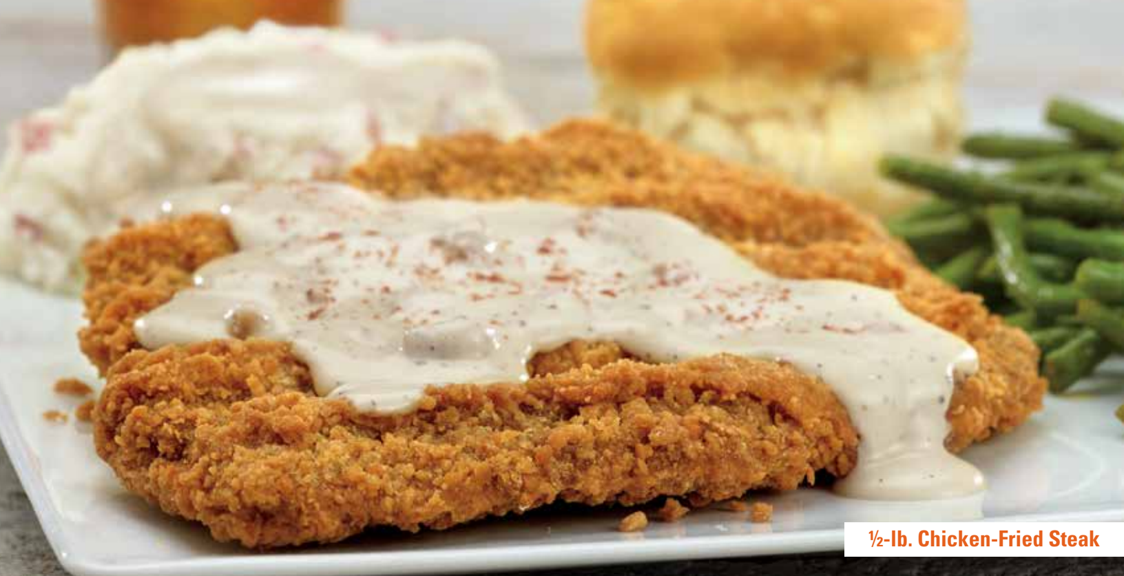
1/2-lb. Chicken-Fried Steak

Tender cut of beef, battered and smothered in country sausage gravy, served with red skin mashed potatoes and gravy, your choice of one side and a fresh-baked buttermilk biscuit. (1240-1610 cal) 14.49