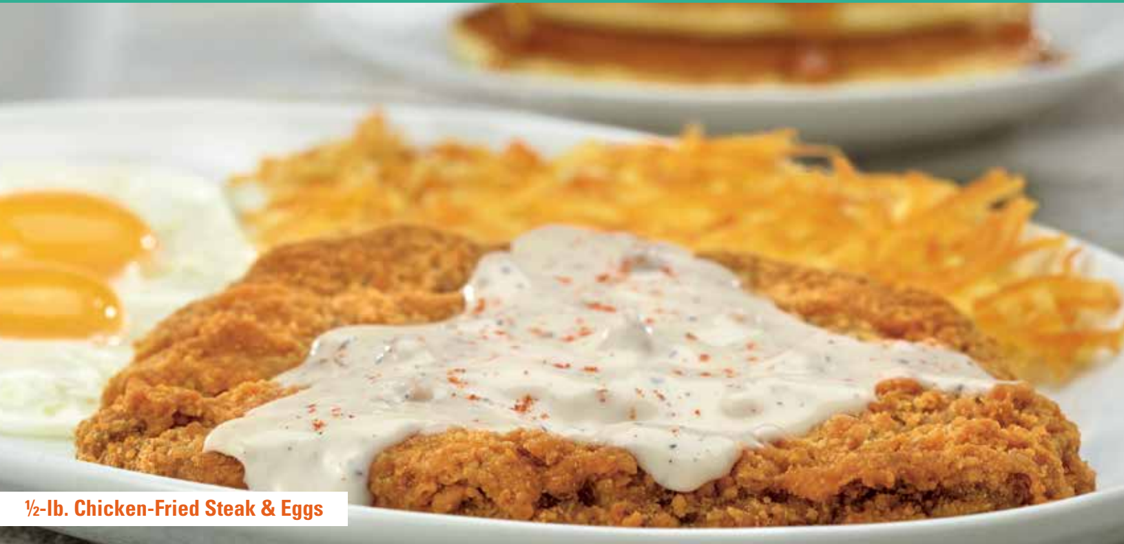
½-lb. Chicken-Fried Steak & Eggs

Two bone-in center cut pork chops and two fresh eggs, any style. Served with three fluffy, made-from-scratch buttermilk pancakes and hash browns or grits. (1590/1610 cal) 14.99