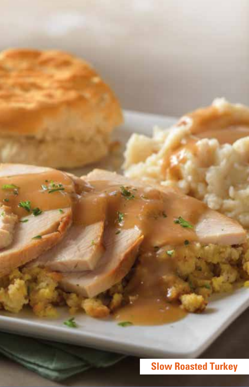
Slow Roasted Turkey

Two grilled chicken breasts covered in melted Swiss cheese, and smothered with sautéed onions, green peppers and mushrooms. Served with your choice of two sides and Texas toast. (1110-1890 cal) 14.99