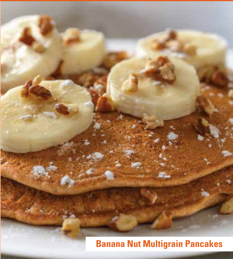
Banana Nut Multigrain Pancakes

Substitute a Supreme Item for only 2.39 Add an additional Supreme Item for only 2.39