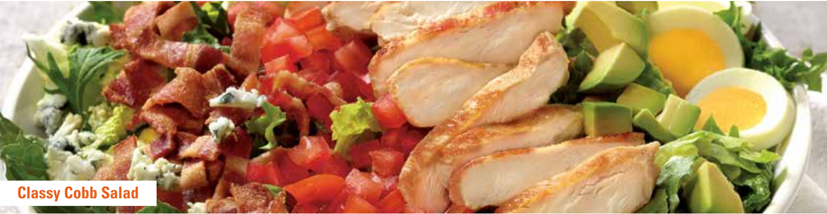
Classy Cobb Salad