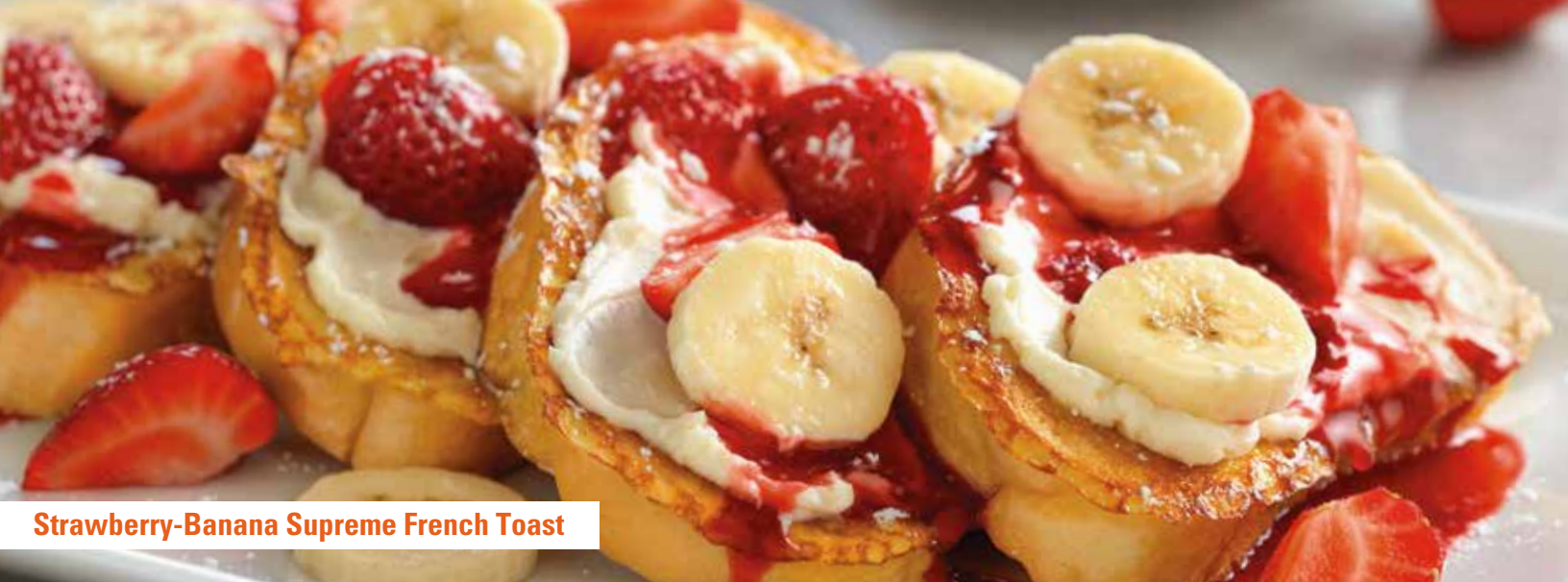
Strawberry-Banana Supreme French Toast

Strawberry, blackberry and sugar-free maple-flavored syrups are available (10-180 cal).