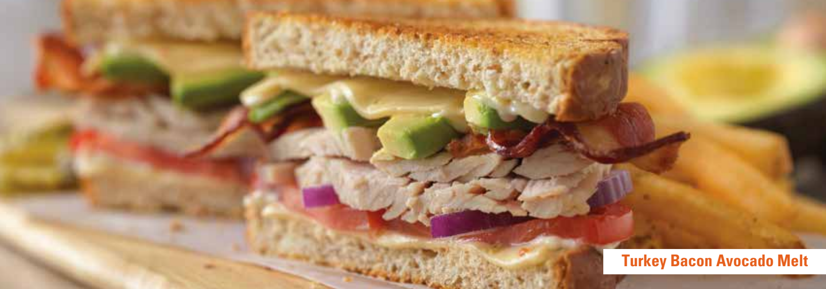
Turkey Bacon Avocado Melt

Served with your choice of French fries (370 cal) or fresh coleslaw (140 cal). Substitute a cup of fresh fruit (30 cal), fresh side salad (35 cal), cup of soup (45-310 cal) or side of onion rings (220 cal) for 99 cents.