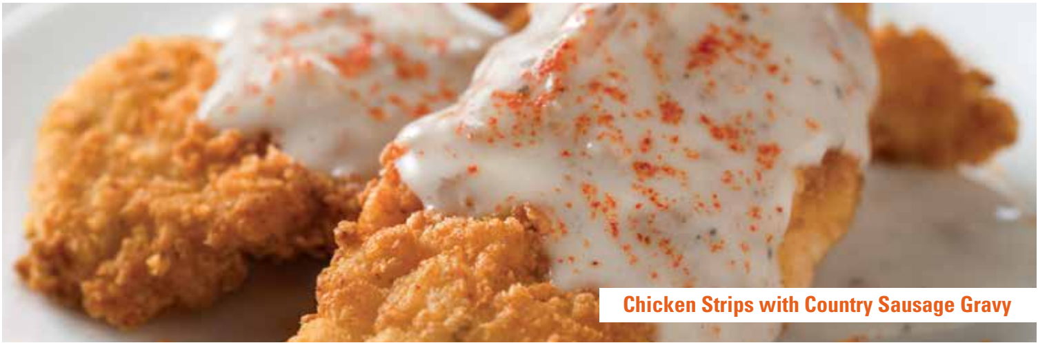
Chicken Strips with Country Sausage Gravy